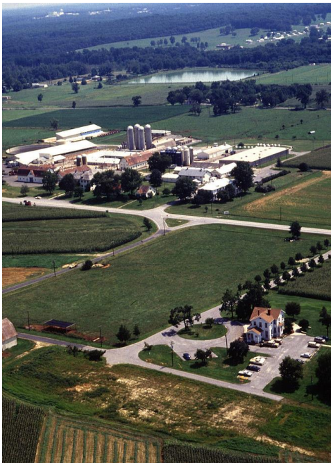
Fund BARC National Priority List Site Cleanup