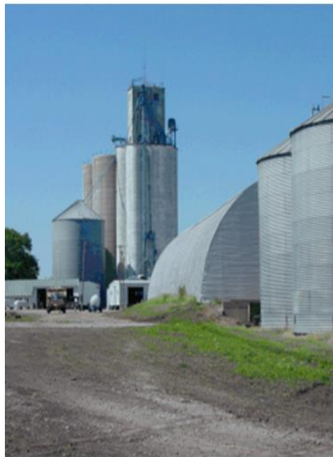
Fund FSA Historic Grain Silo Site Cleanups