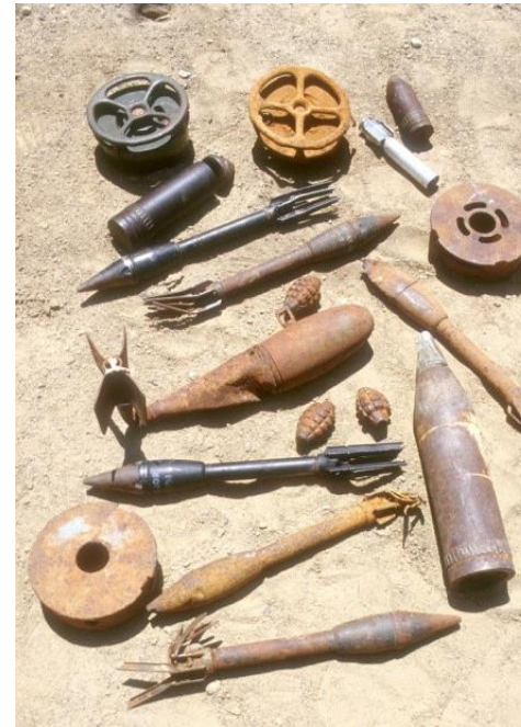
Improve USDA Agency Collaboration with DoD on site cleanup