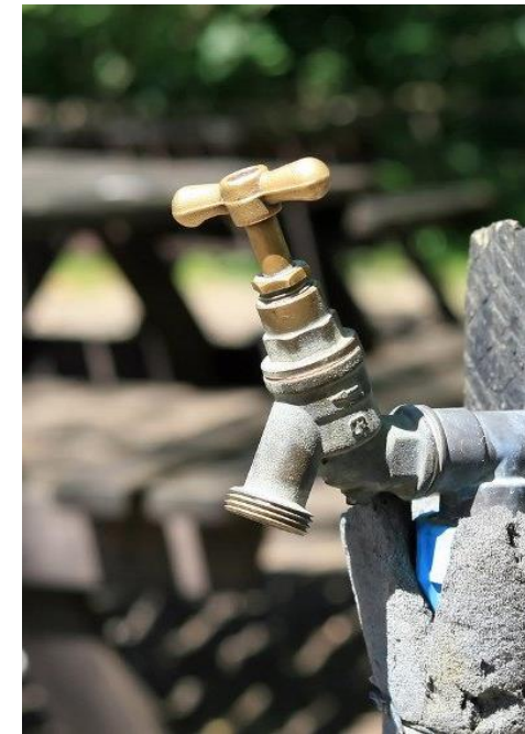
Improve Facility Environmental Compliance