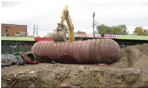
Underground Storage Tank Removal

3001 Zuni St., Denver, CO 80211 ---- (OPS Event ID 6331)